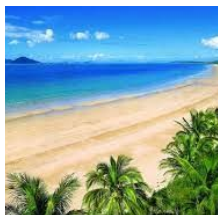
How we became Mission Beach