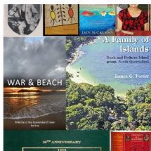
How MBHS got started