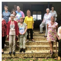
MBHS — About Us