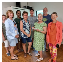
Celebrating Our First Year