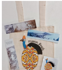
MBHS: Newly released merchandise