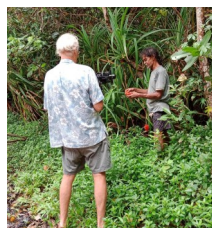
Launch of new Djiru short video series