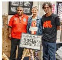
Touring 'Echo of the Past': Palm Island