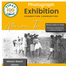
Tully 100: Connecting Communities