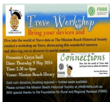
MBHS Trove workshop - Mission Beach