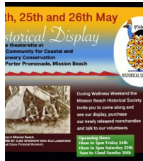
Wellness Weekend 24-26 May